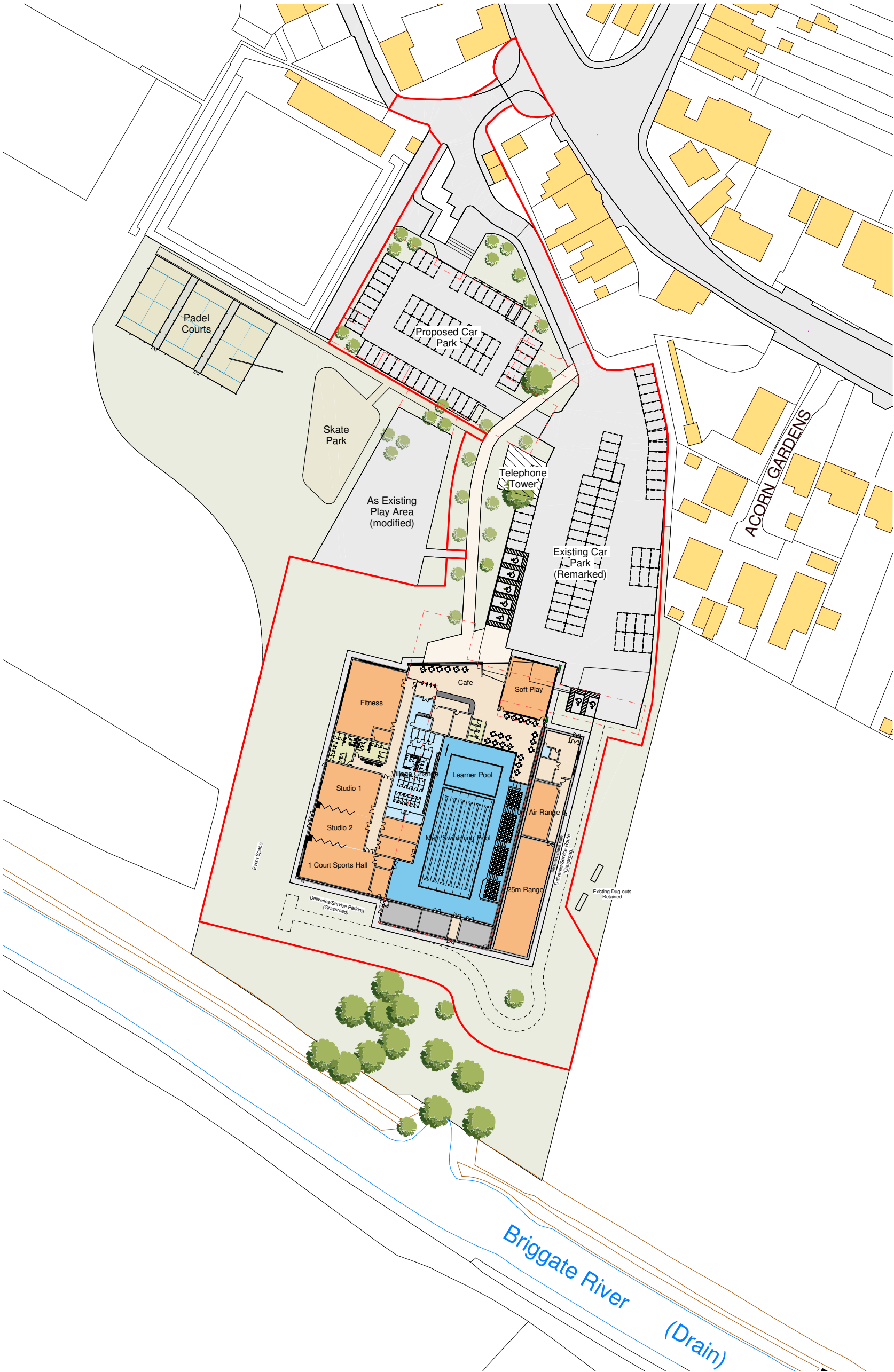
1 | Site - Proposed 1 : 500