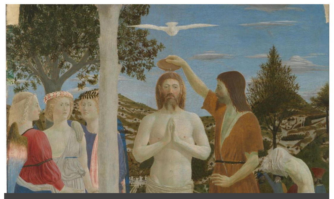
This Sunday we continue to celebrate Epiphany as we reflect on the Baptism of Christ.