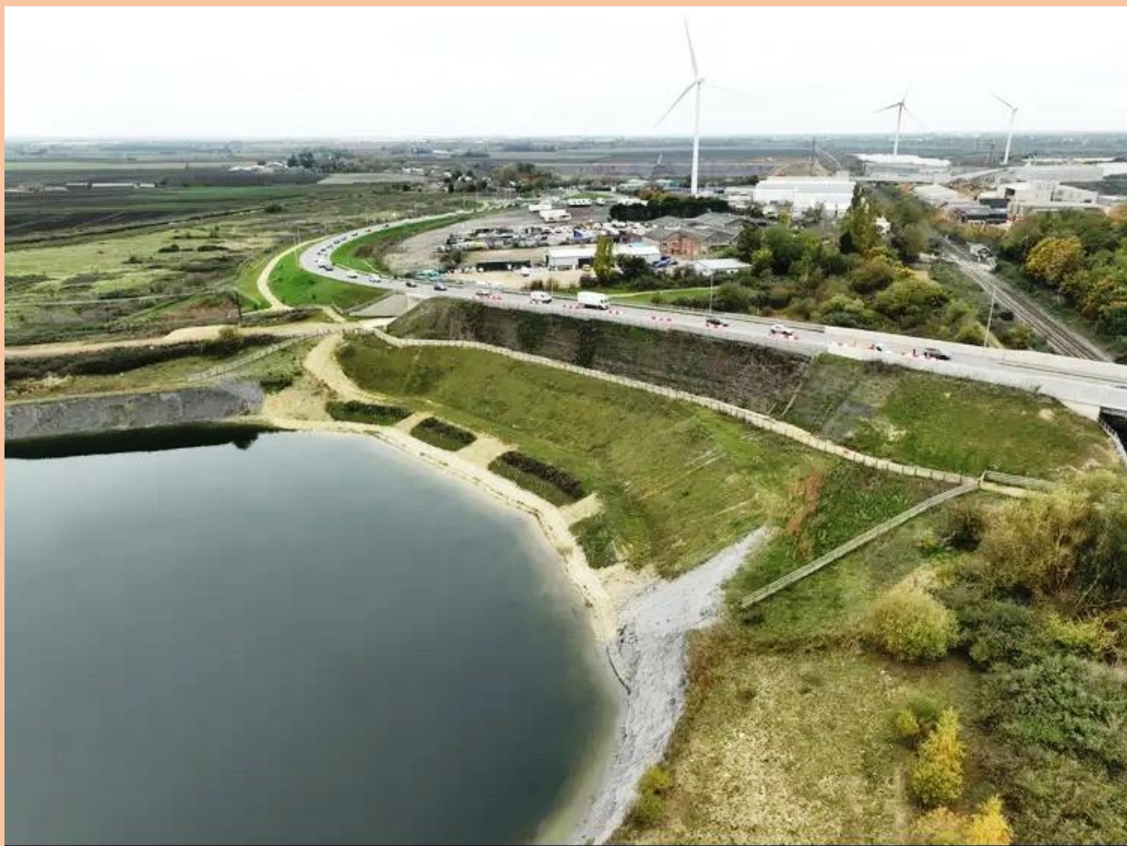
Picture shows how 'steep' the support embankment is.

(Left) Cambs County Council have never been the best at communicating with the public or we Councillors. (Signage update 2020)