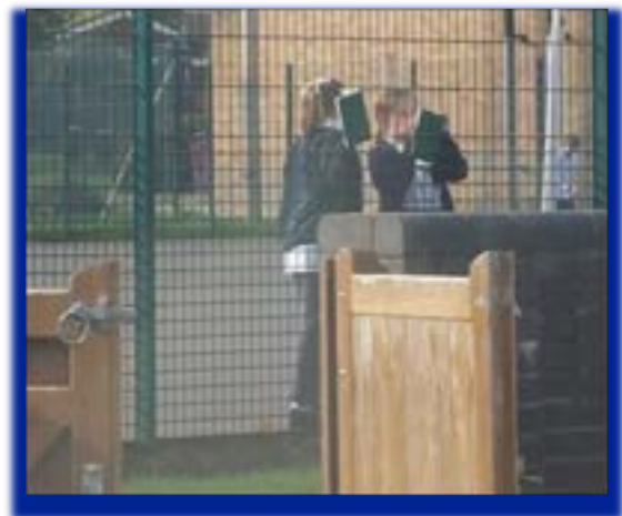
Two of the JTA's from Bar Hill planning in their break time, now that is dedication!

For more information on the Junior Travel Ambassador and Youth Travel Ambassador schemes please contact