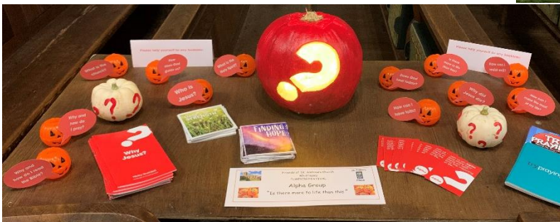
Alpha Course @ Pathway