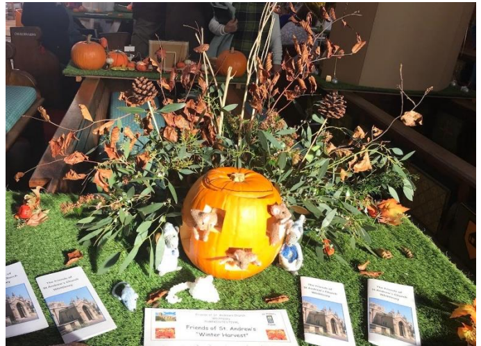
Friends of St Andrew's