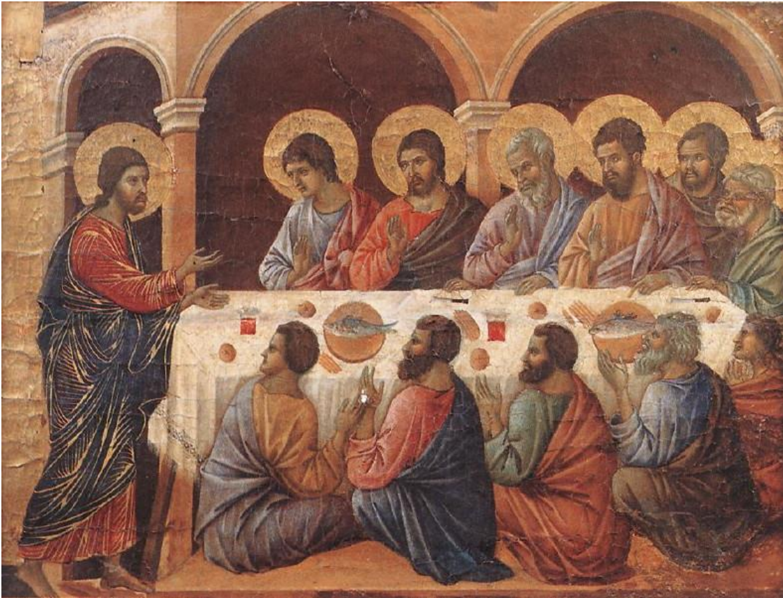
Jesus' Appearance While the Apostles are at Table by Duccio di Buoninsegna (1255-1319)