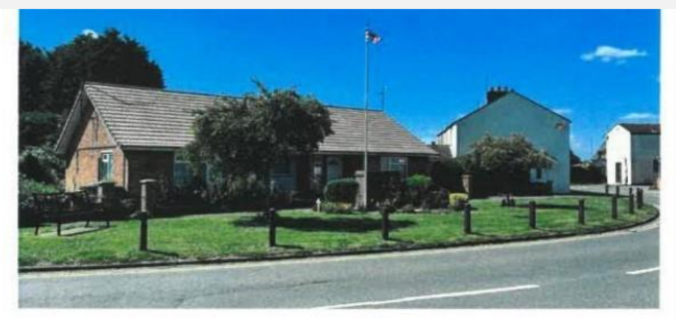
Figure 4: Eastrea War Memorial

AOB: CIIr Wainwright: There will be a memorial service in honour of those who lost their lives when a Lancaster Bomber crashed near Eastrea @ The Eastrea War Memorial April 19<sup>th</sup> @ 10:45