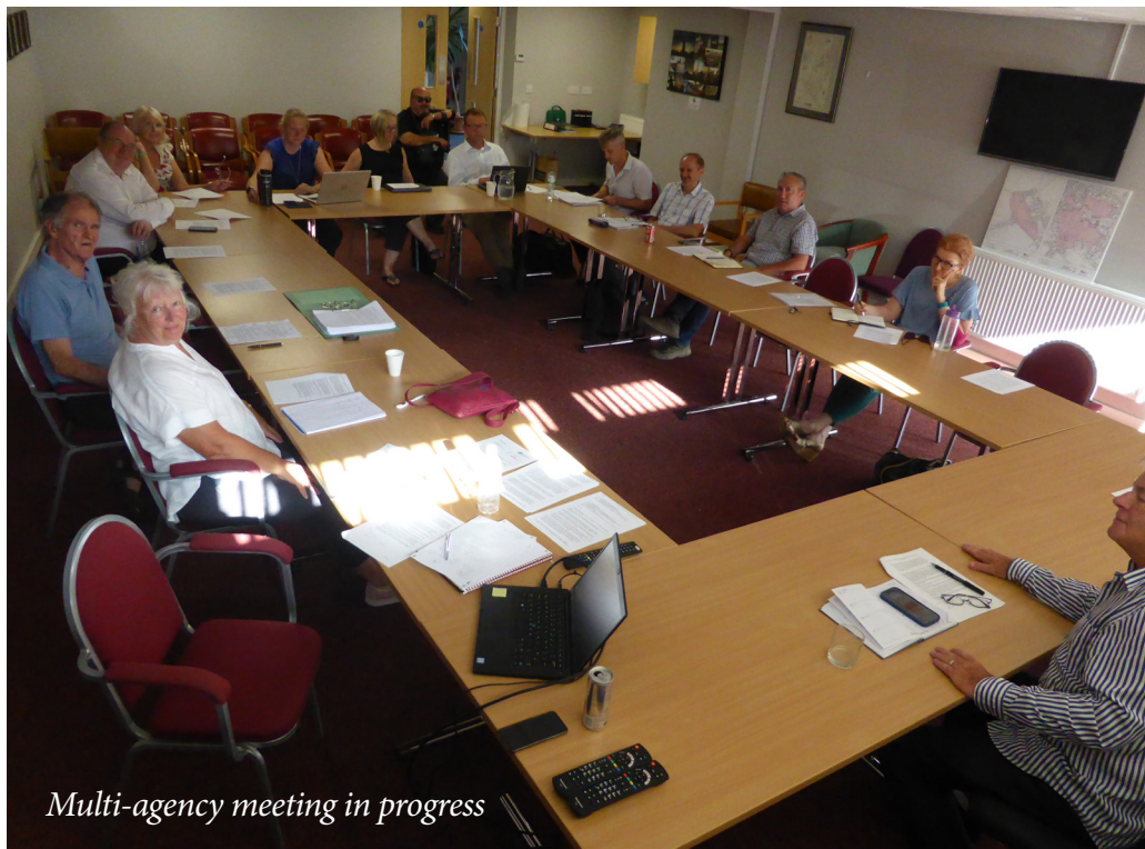
Multi-agency meeting in progress