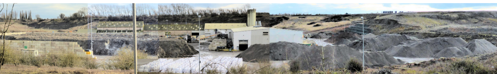
Saxon Pit industrial bottom ash processing plant and stockpiles.

■ If you have issues with noise, dust or smell, it is important that every occurrence is reported to the Environment Agency – so please call them on 0800 807060.