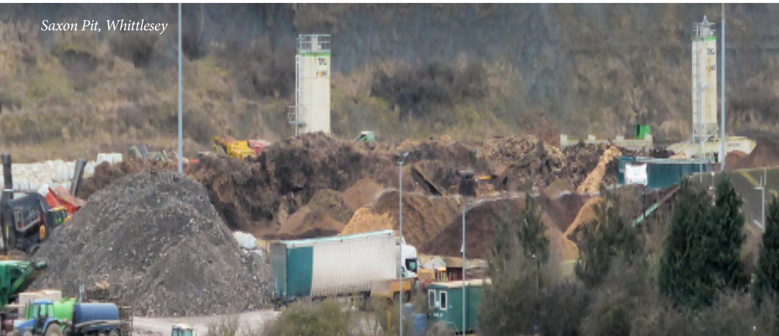
Saxon Pit, Whittlesey

If the law and enforcement regimes have allowed all this to happen then we need our representatives to campaign for change.