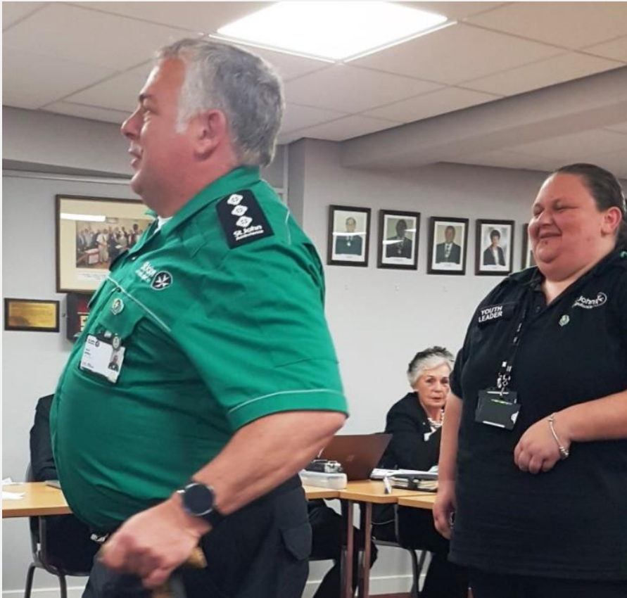
St Johns Ambulance

Disclaimer: These observations are not the 'official' minutes of the meeting, these are supplied by Whittlesey Town Council, normally (1) month following this meeting and can be viewed on their website. Decisions and Voting at this meeting may be ratified and confirmed at the following months meeting.