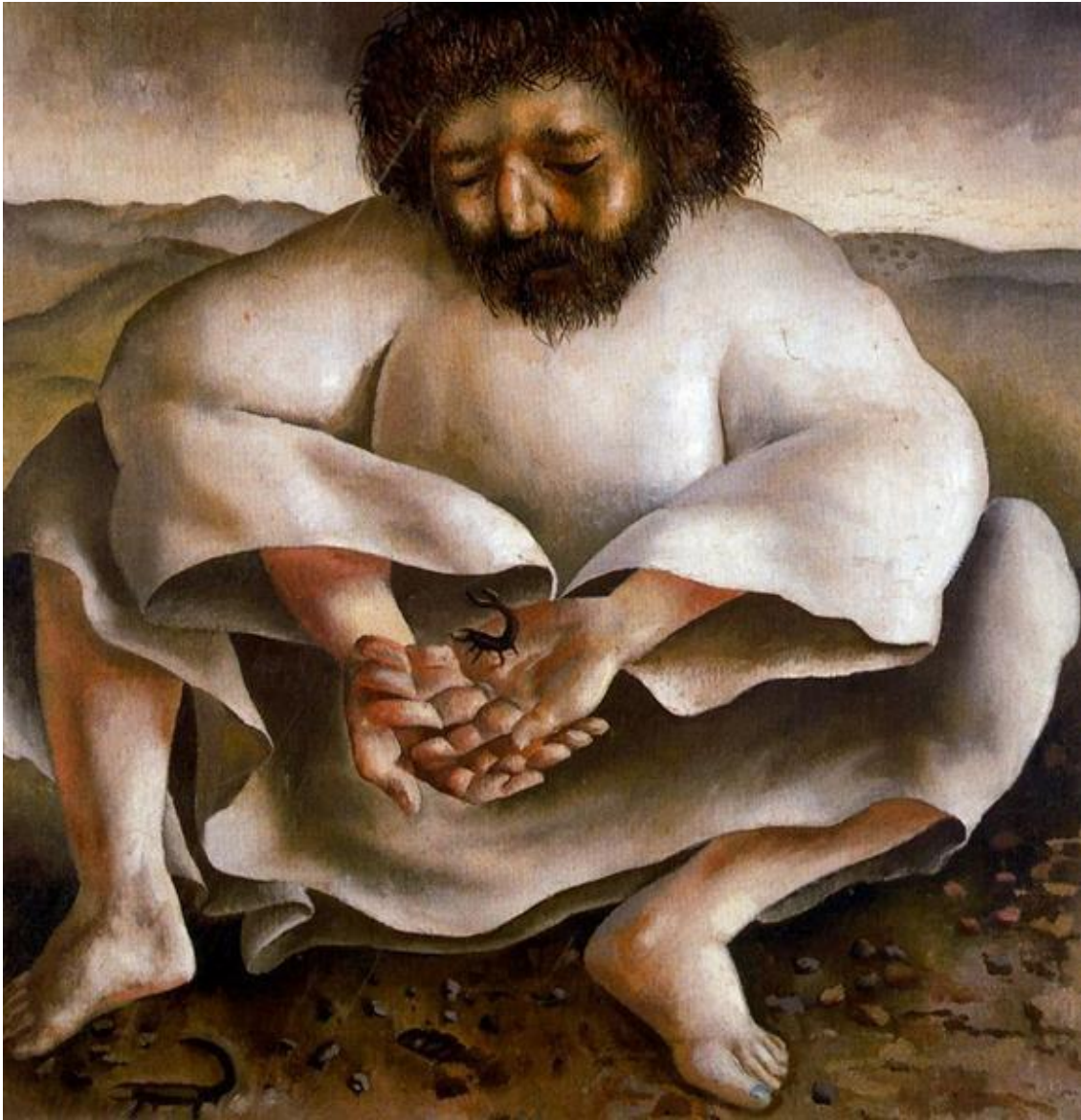
A well known Christian painting of: "Christ in the Wilderness - The Scorpion" , 1939, Stanley Spencer, (1891 - 1959)