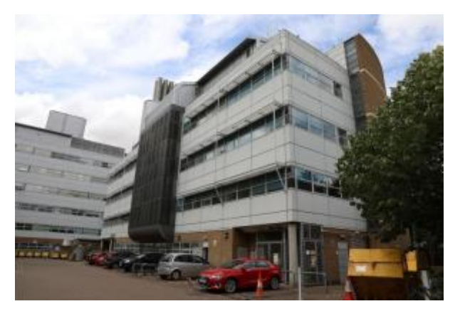
2 - Early Cancer Institute

For more information on the new institute visit the CUH website here