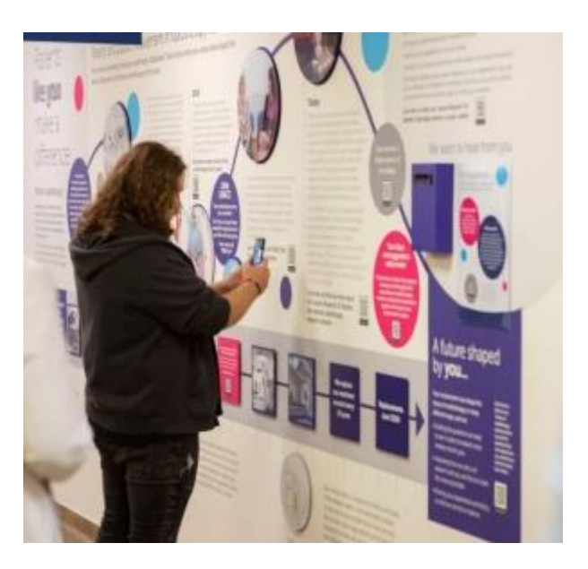
4 - The multimedia display at Addenbrookes.

To find out more on the new radiotherapy research, visit the CUH website <u>here</u>