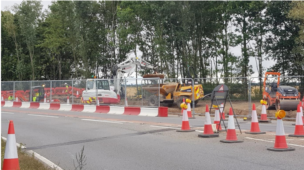
Caption: work taking place to upgrade the Guyhirn junction of the A47