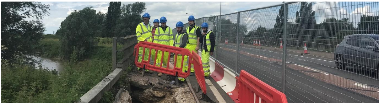
Caption: a recent visit by students from West Anglia College to the Guyhirn site