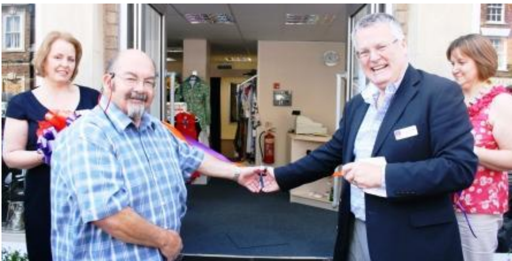
Opening day of The EACH shop market Street Whittlesey May 2011