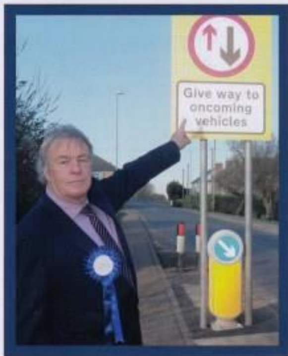
Traffic Calming Pondersbridge