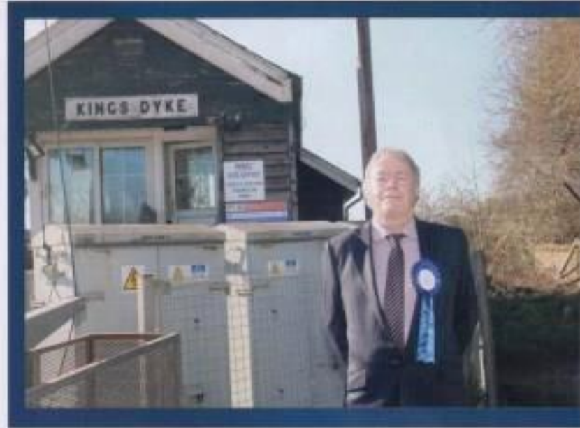
Level crossing to be replaced by new bridge