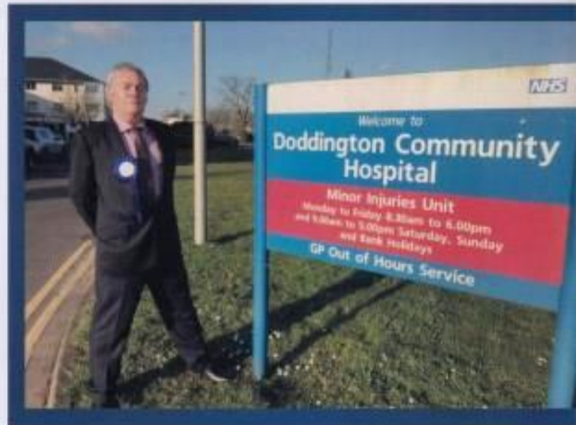
Must keep this unit open for all in Fenland