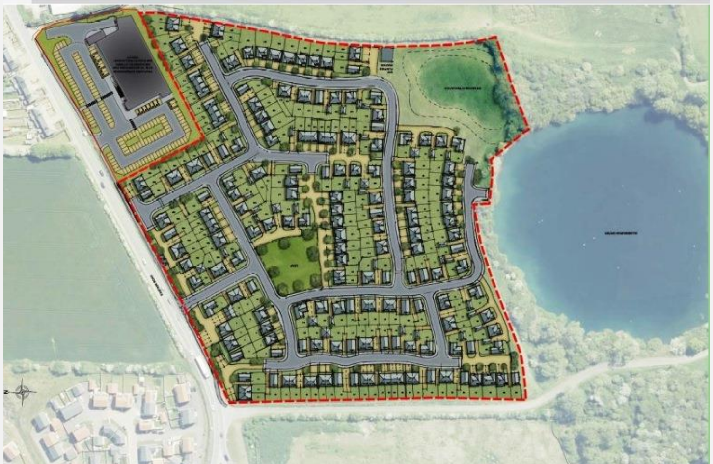
Indicative plan Eastrea Road on the left, separate access from A605