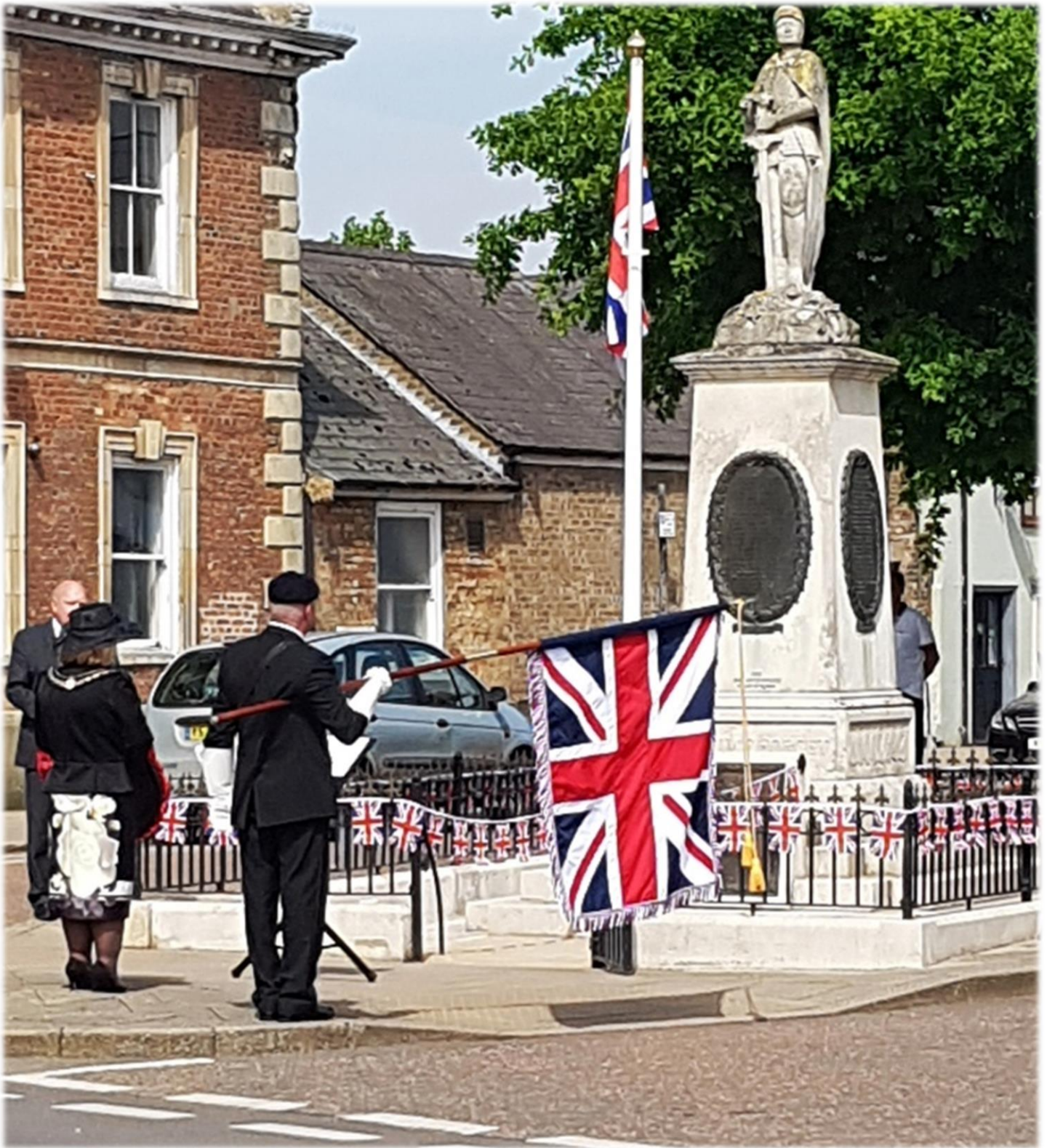
The Royal British Legion – Whittlesey – Lowering of the standard at Whittlesey War Memorial @ 11:00am on Friday 08 th May 2020 to commemorate the 75 th anniversary of the ending of the 2 nd world war in Europe.