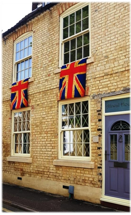
Aliwal House Whittlesey