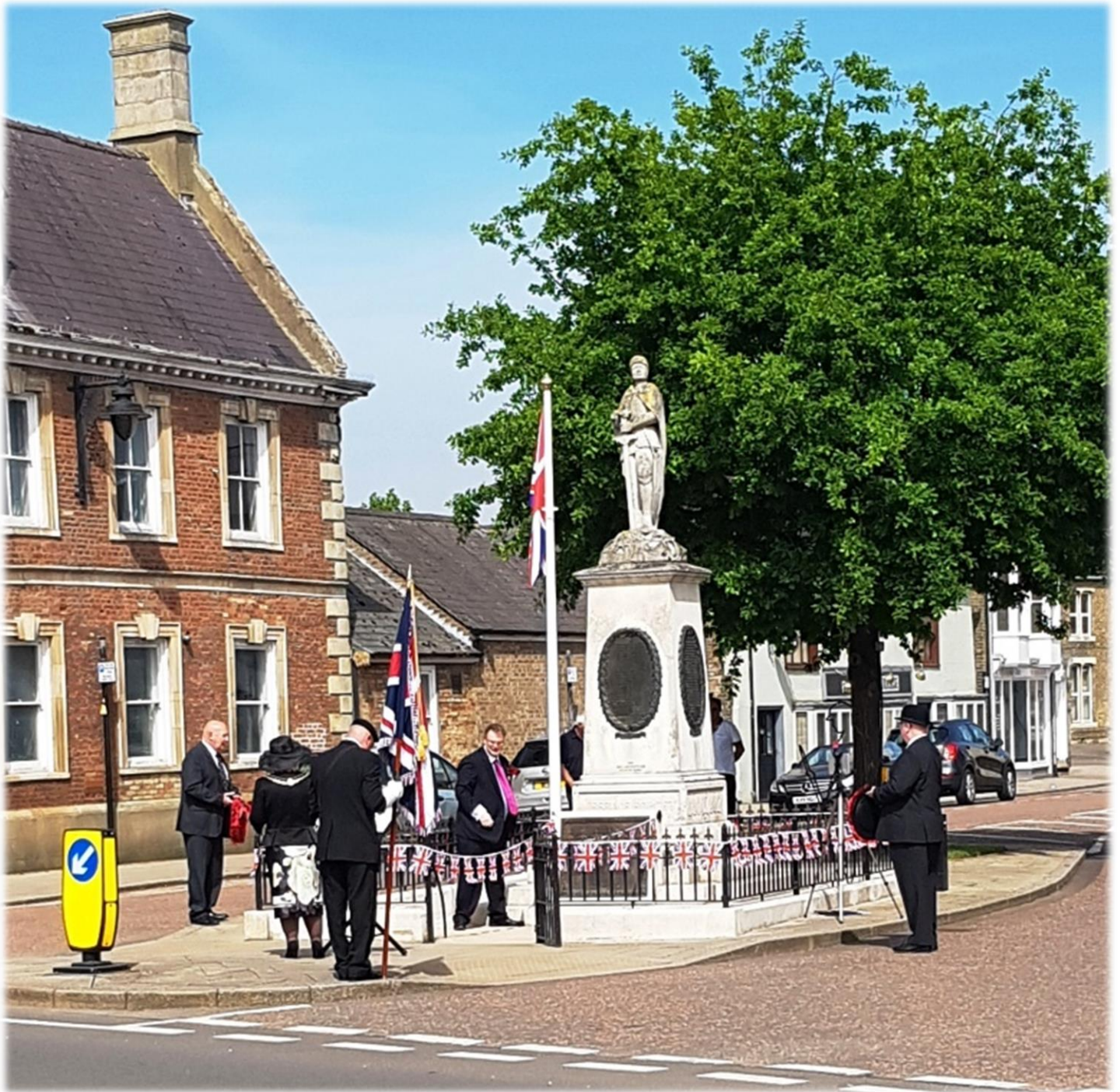
On a beautiful sunny Friday morning – at the War Memorial Whittlesey 08 th May 2020 Preparations for the celebration marking the 75 th anniversary of the ending of the 2 nd world war in Europe.