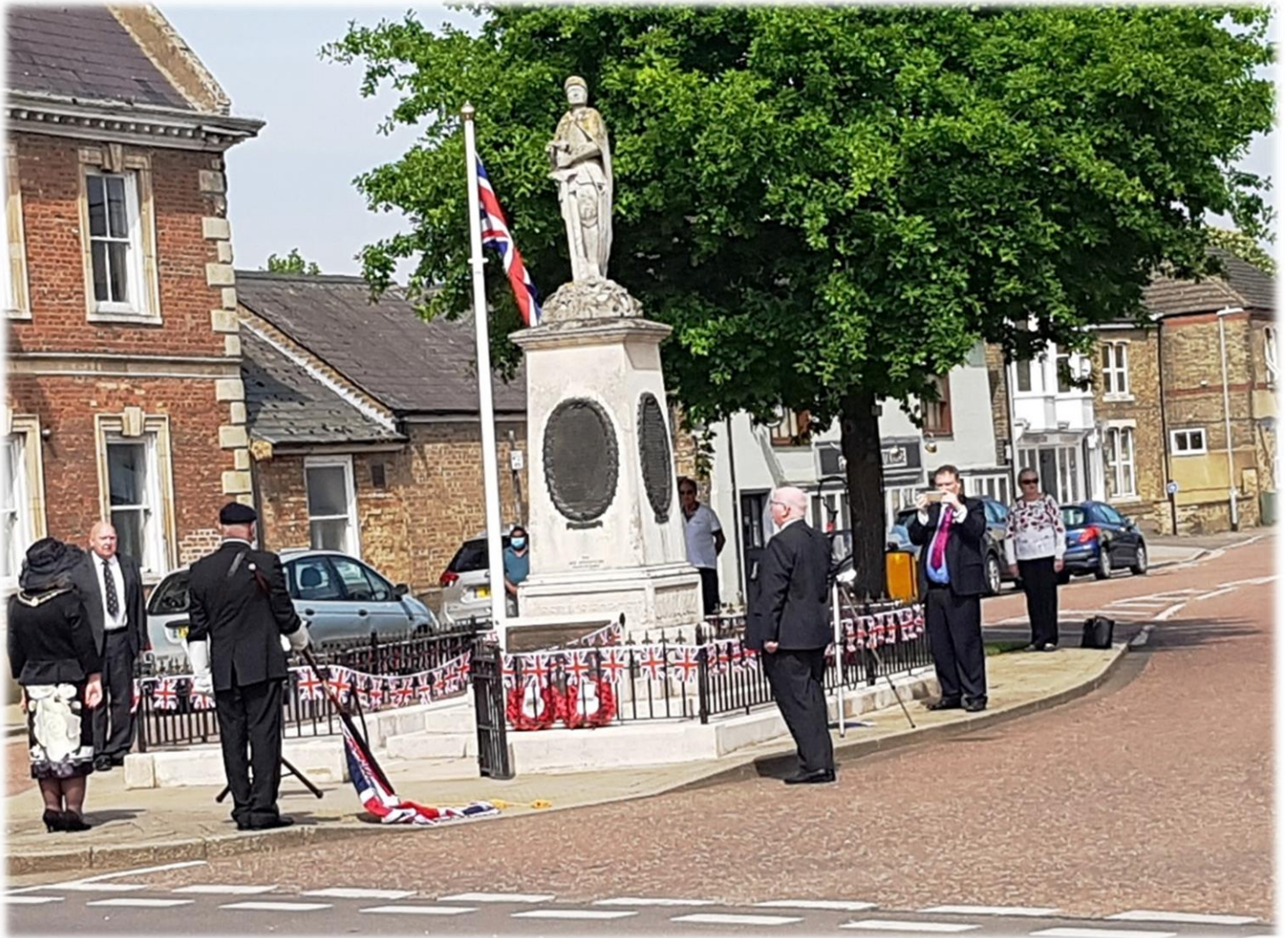
The Royal British Legion – Whittlesey – Lowering of the standard at Whittlesey War Memorial @ 11:00am on Friday 08 th May 2020 to commemorate the 75 th anniversary of the ending of the 2 nd world war in Europe.