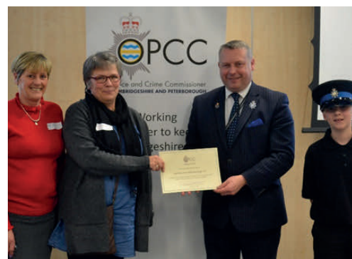
The Commissioner at last year's celebration for Youth and Community Fund recipients

More information about the funding can be found here: www.cambridgeshire-pcc.gov.uk/get-involved/funding/