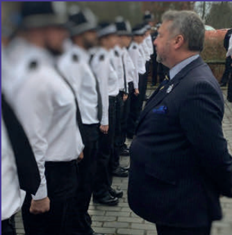
Police Commissioner oversees new officers at their passing out parade