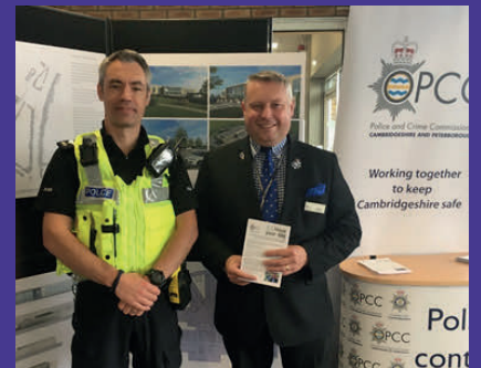
Meeting local people in Milton to talk about my Southern Police Station proposal