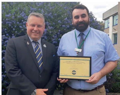
Police Commissioner and ICV Manager celebrating silver status

The countywide scheme was awarded the silver status by national body ICVA (Independent Custody Visitors' Association).