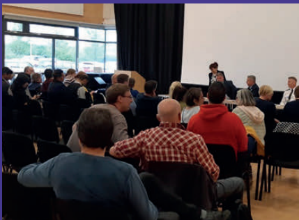
Public meeting held in Cambourne to discuss concerns around knife crime