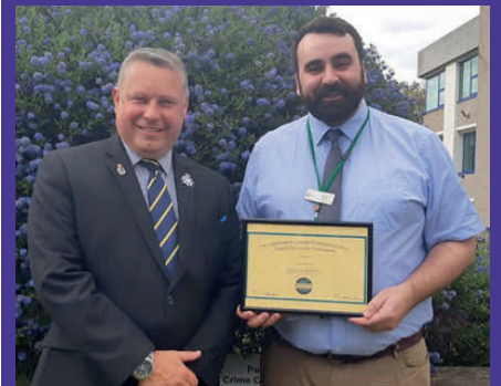
Awards season begins!