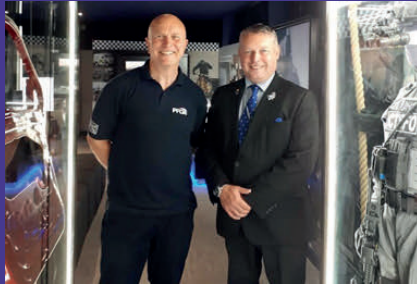
Checking out a 'gem of the Fens', the Museum of Armed Policing