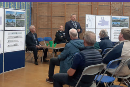
Consultation for the new Southern Police Station begins with public meeting in Milton