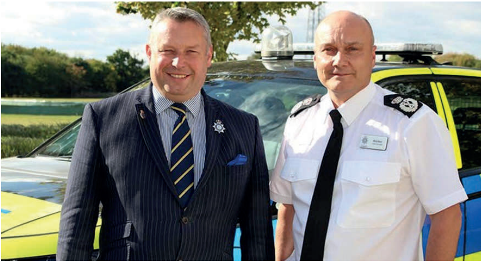
The Commissioner with the Chief Constable at Constabulary HQ