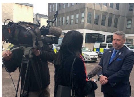
Police Commissioner doing an interview about the proposal

A link to further information on the consultation and survey is here: https://www.cambridgeshire-pcc.gov.uk/get-involved/your-views/have-your-say/